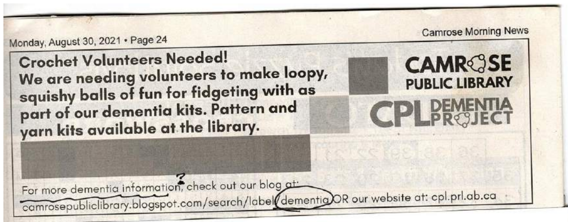
The ad in the Morning News

I received a phone call and follow-up email from a community members that was concerned about an ad that ran in the Camrose Morning News. The email and my ultimate response are in the items for information.