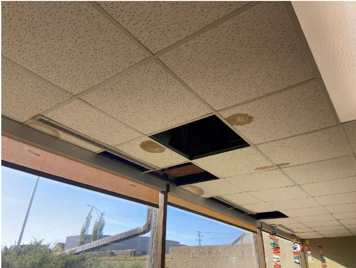
Damaged and missing ceiling tiles downstairs.

Left: New rain on the south-west side. Right: New drain on the south-east side.