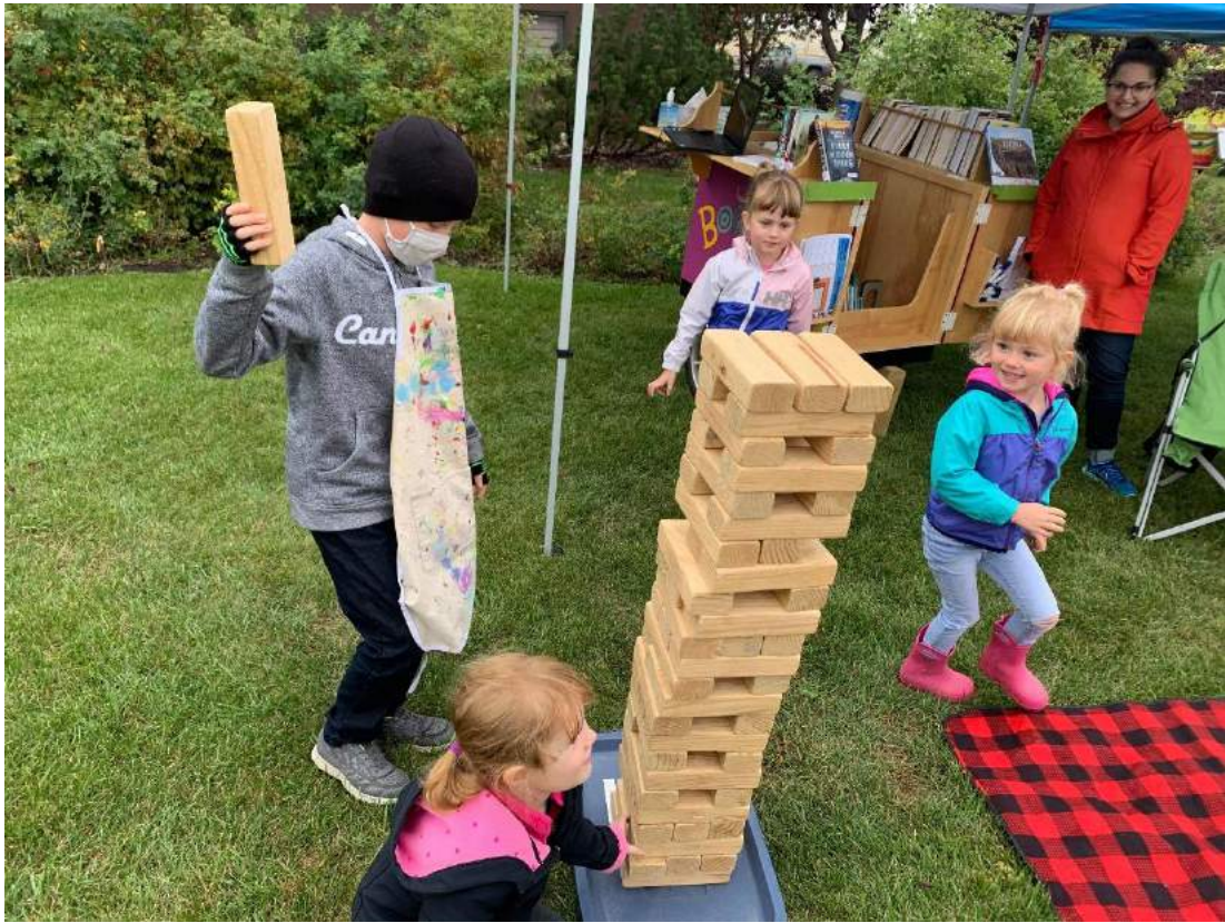
Kids enjoying a game of Jenga.