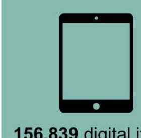
156,839 digital items circulated