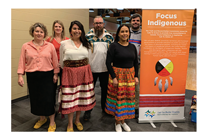
Lac La Biche County "Focus Indigenous" initiative

The Partnership award is given for an innovative initiative involving a local or regional partnership that achieves results that could not have otherwise been accomplished by the municipality alone. This could involve cooperation, coordination, and collaboration with other municipalities, businesses, Indigenous communities, non-profit organizations, community groups, and other orders of government to achieve a specific outcome.