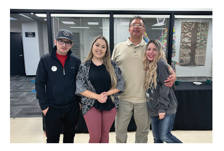
Library Ambassadors pose for a photo after setting up for one of Medicine Hat Public Library's weekly community coffee events.

Participating individuals, called library ambassadors, earn cash payments in exchange for meaningful work at the library. Duties may include the set-up and take-down of library programs and events, hosting weekly community coffees,