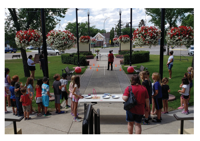
A group of children participating in a science program outside the Raymond Public Library.