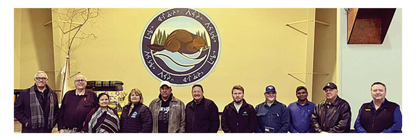
Lac La Biche County "Indigenous Collaboration Committee" initiative

The Partnership award is given for an innovative initiative involving a local or regional partnership that achieves results that could not have otherwise been accomplished by the municipality alone. This could involve cooperation, coordination, and collaboration with other municipalities, businesses, Indigenous communities, non-profit organizations, community groups, and other orders of government to achieve a specific outcome.