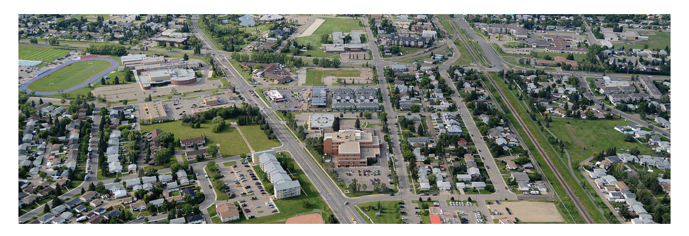
City of Leduc "Airport Vicinity Protection Area Amendments" initiative

The Red Tape Reduction award is given for an innovative initiative that improves a municipal program or service by saving time, money, and resources, or impacts municipal operations by reducing regulatory, policy, or process requirements.