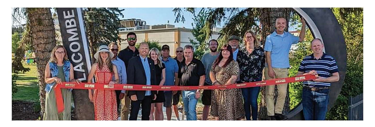
City of Lacombe Downtown Area Redevelopment Plan (DARP) Priority Projects "Heart of Lacombe" initiative

The Service Delivery Enhancement award is given for an innovative initiative that improves or presents a new approach to how a municipality can deliver a program or service.