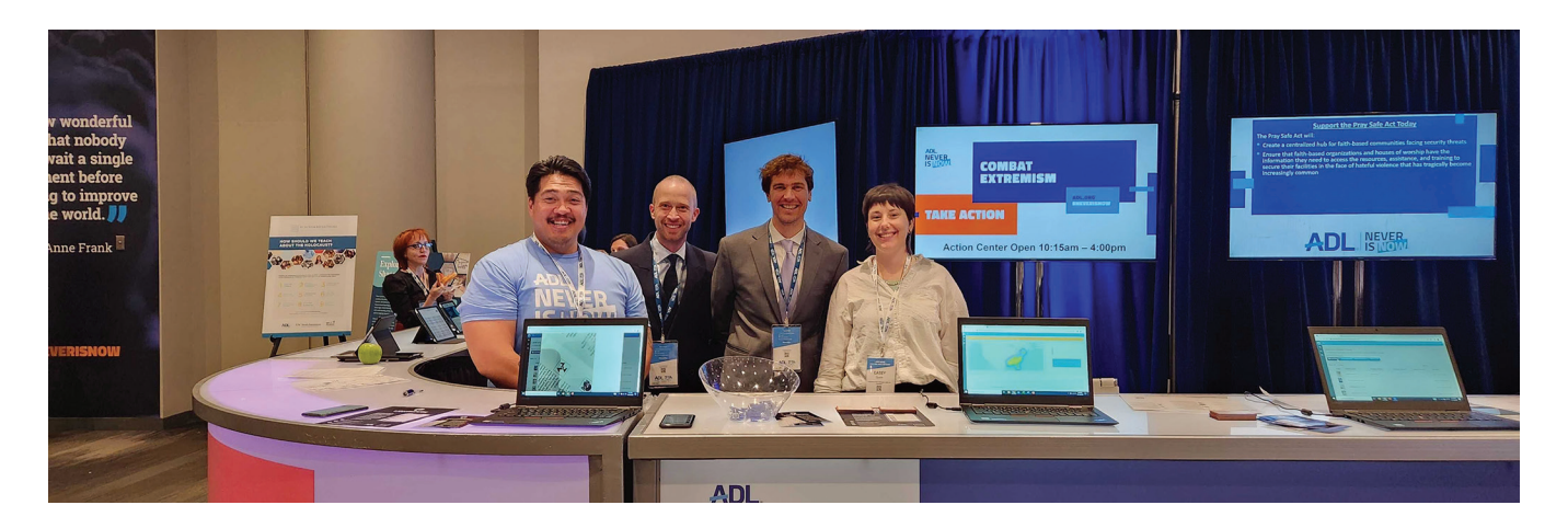
City of Edmonton "Lighthouse" initiative

The Enhancing Community Safety award is given for an innovative initiative that engages the community to address a safety issue. This could involve crime prevention, infrastructure enhancements, and community services initiatives.