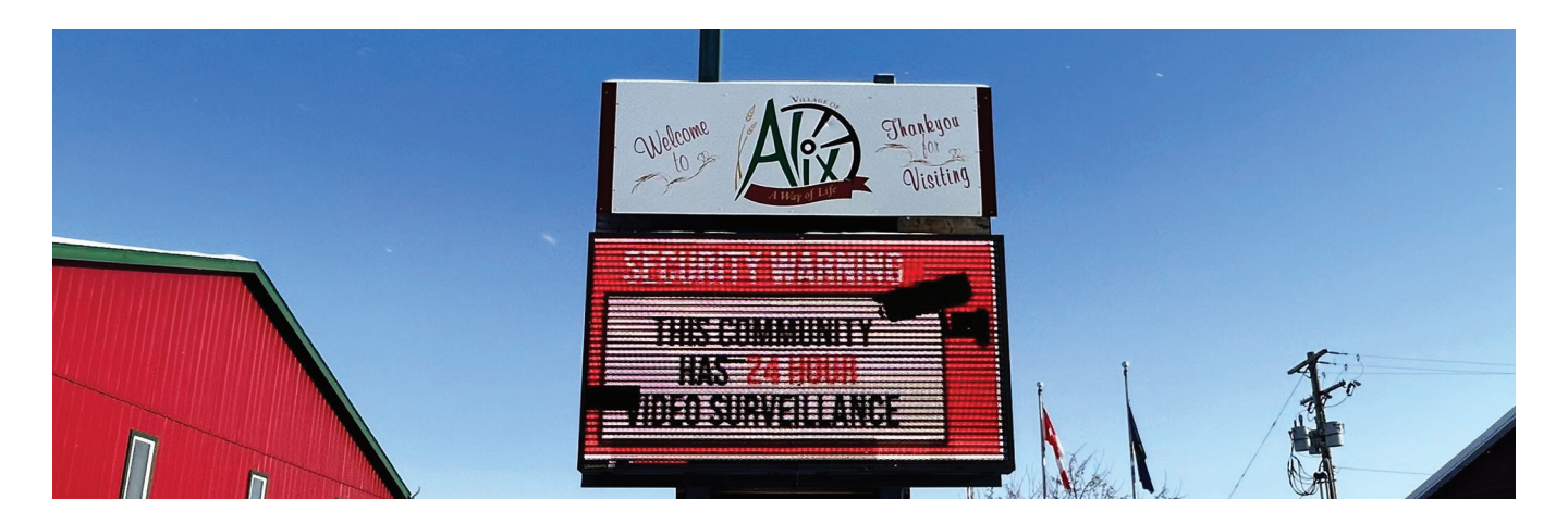
Village of Alix, "Partnering for Crime Prevention" initiative

The Smaller Municipalities category is open to municipalities with populations less than 5,000. The award is given for a municipal initiative that demonstrates leadership, resourcefulness, or innovation, or both, to better the community.