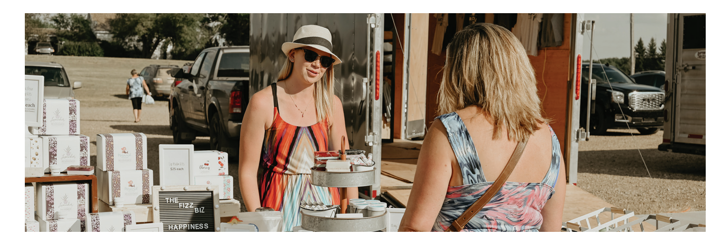
Flagstaff County "Flagstaff Crafted" initiative

The Building Economic Strength award is given for an innovative initiative that builds the economic capacity and/or resiliency of the community and/ or improves the attractiveness of the community to businesses, investors, and visitors.