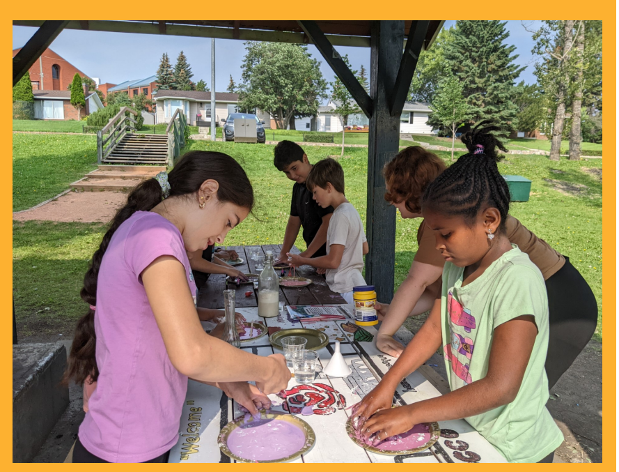
Making Oobleck with Action for Healthy Communities.