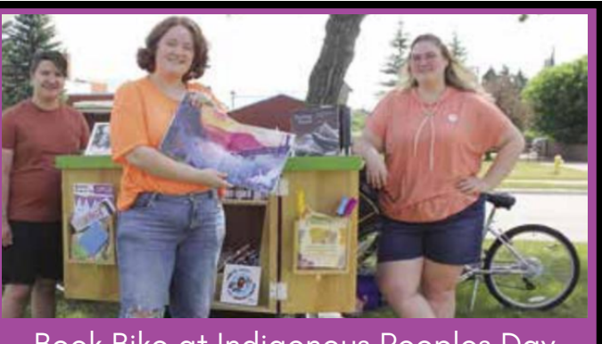
Book Bike at Indigenous Peoples Day.