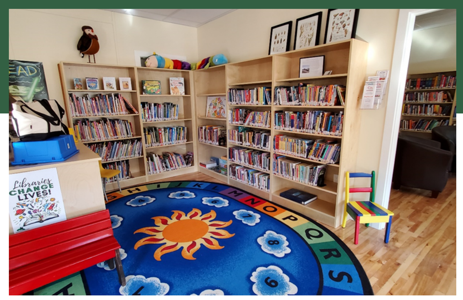
Nordegg Public Library