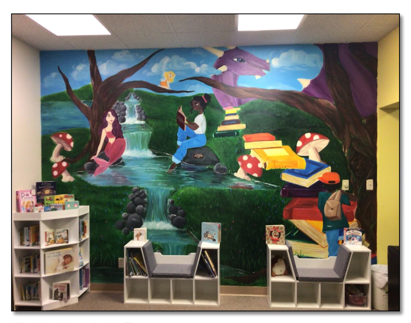
Mural painted in 2020 by Leah Zimmer